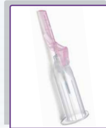
Eclipse™ Signal™ Blood Collection Needle with flashback and integrated Holder from BD Vacutainer®