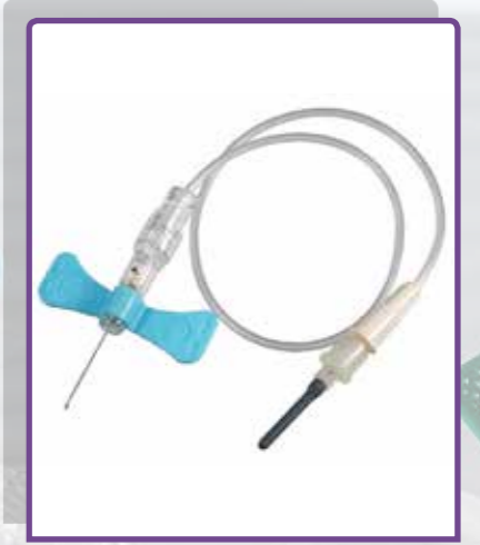
Push Button Blood Collection Set from BD Vacutainer®