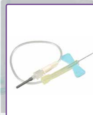
Safety-Lok™ Blood Collection Set from BD Vacutainer®