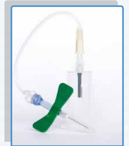
VACUETTE® Safety Blood Collection Sets with pre-attached holder from Greiner Bio-One