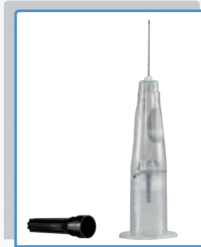
VACUETTE® Premium Safety Needle System with 'passive' activation from Greiner Bio-One

New legislation is on its way that aims to prevent injuries and infections caused by accidents during the use of sharps including needlestick injuries. The companies who manufacture blood collection products offer a wide range of innovative designs where needles are safely retracted or covered to help keep us safe, here are some that are available.