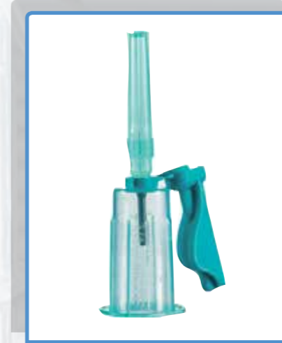
VACUETTE® Quickshield Complete Plus with flashback and pre-attached holder from Greiner Bio One